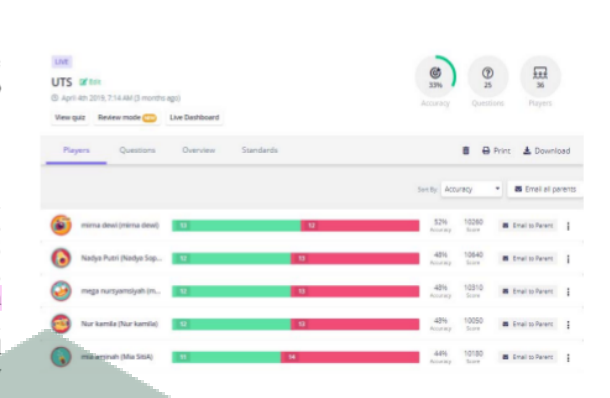
Fig. 3. Analysis of the middle semester student test answers

Based on figure 2. It appears that quizizz presents test or quiz services online without having to register first, students can immediately take the test. More detailed analysis presented by quizizz as follows:More detailed analysis presented by quizizz as follows: