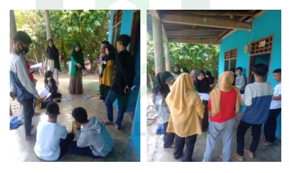
Figure 1 & 2, the researcher was dividing students into 3 groups.