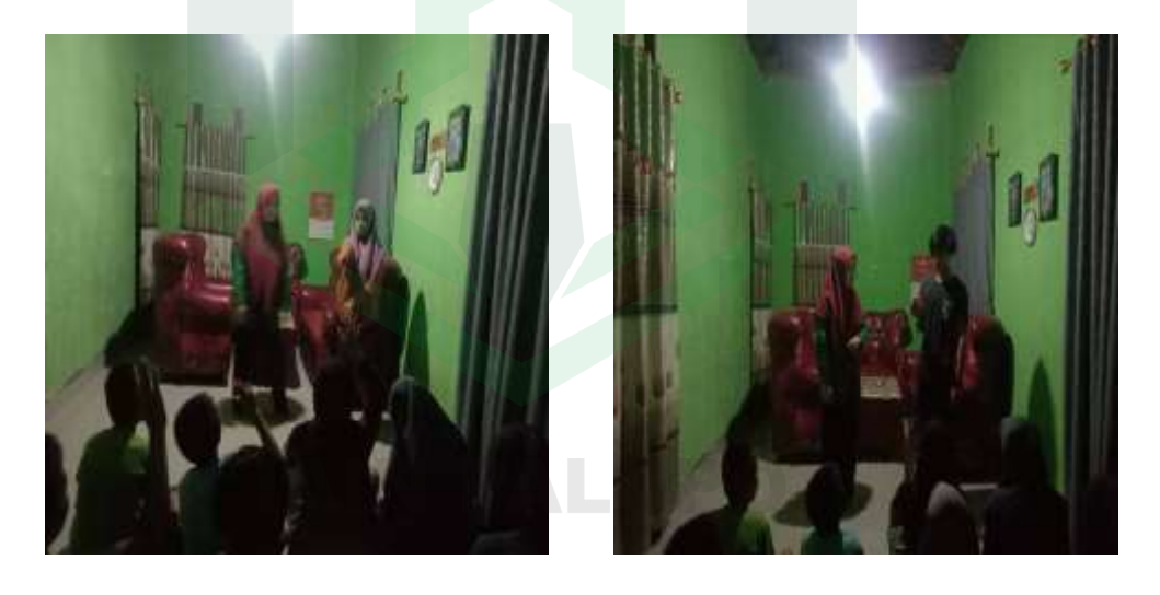
Figure 3, the student was choosing other student to describing the picture in the flashcard.

Figure 2, the student was describing the picture in the flashcard.