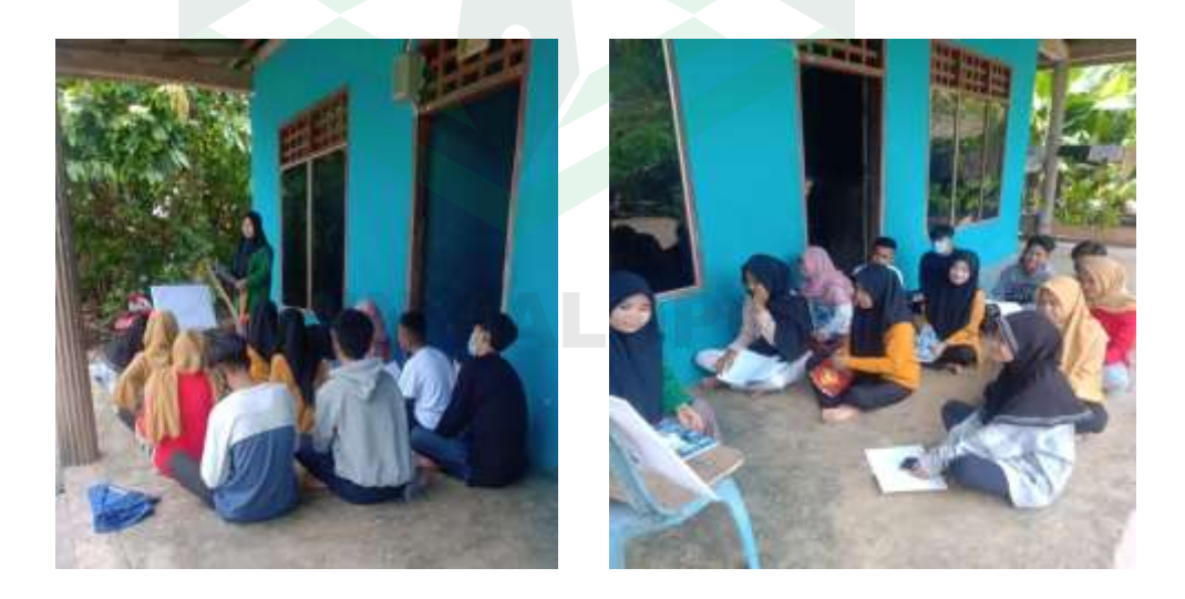
Figure 1 & 2, the researcher was introducing herself and explaining the material to the students.