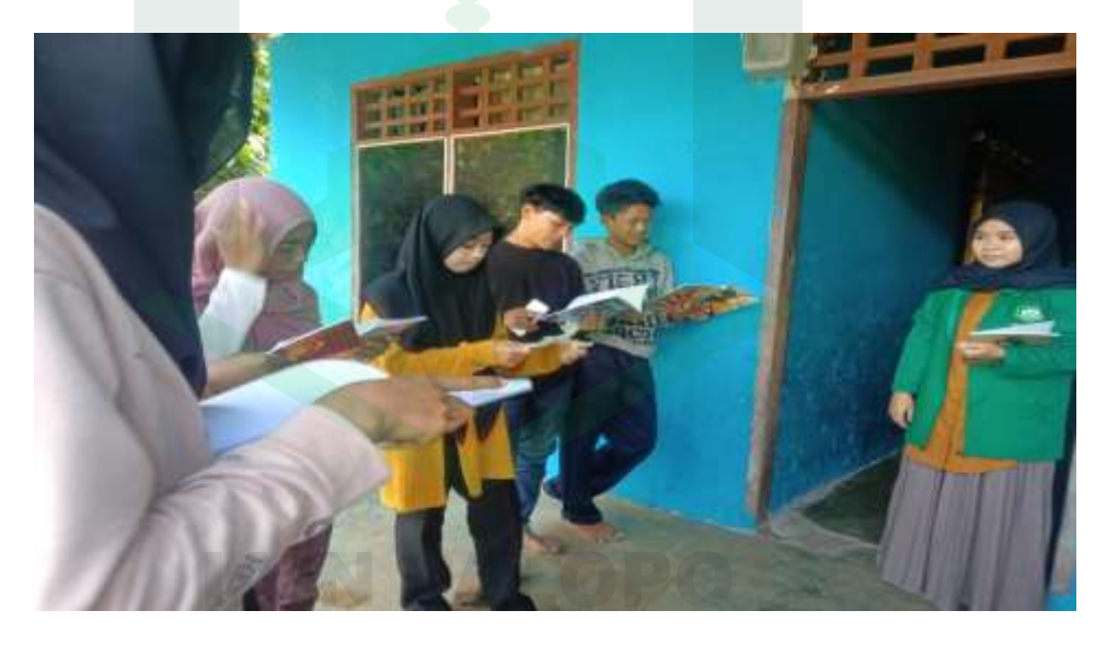
Figure 5, the researcher was observing the students in doing the task.