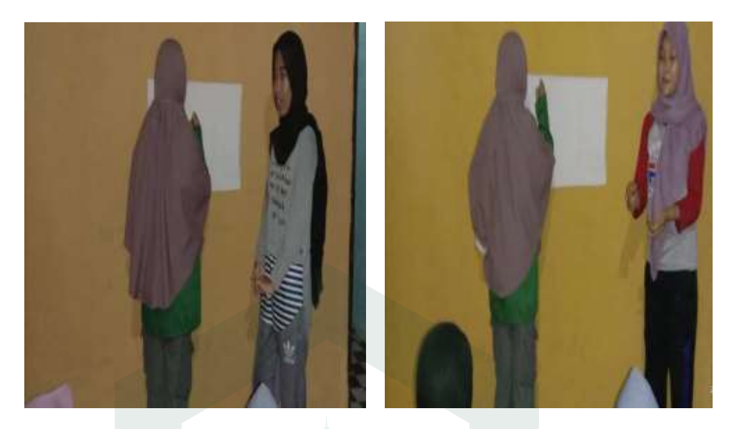
Figure 1 & 2, the students were doing a post-test. They were describing the person.