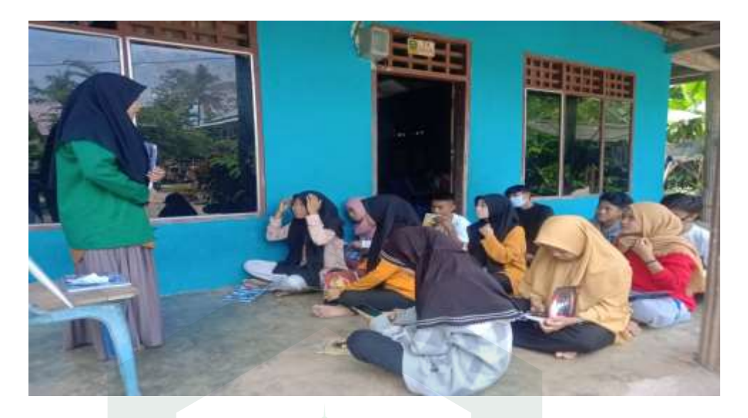
Figure 1, the researcher was explaining the material to the students.