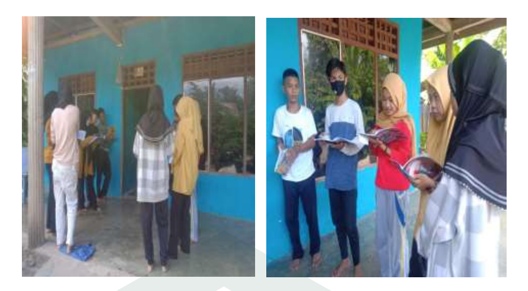
In Figures 3 & 4, each group was making the description of the picture on the flashcard.