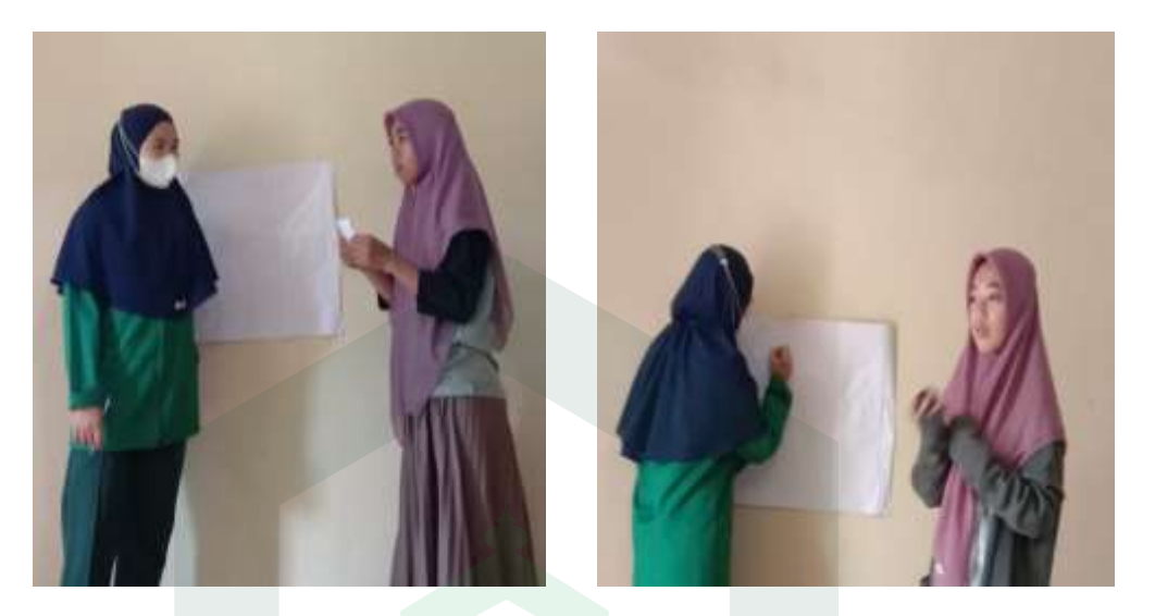
Figure 1 & 2, the students were doing a pre-test. They were describing thing.