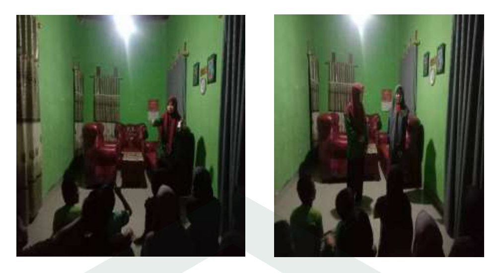
Figure 1, the researcher was choosing one students to describing about thing in the flashcard.

Figure 2, the student was describing the picture in the flashcard.