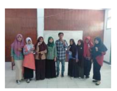
Figure 3 Giving Awards

Rewarding activities are activities intended to provide reinforcement in the form of words or goods. In implementing this model, awards are given in the form of words of congratulations for being selected as the best group in window shopping learning and giving pins for courses as a form of prize (Shoffa & Suprapti, 2017).