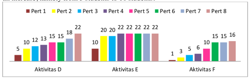
Figure 5 Comparison of Student Activity Cycle I and Cycle II (Aktivitas

Based on Figure 4 student activity at each meeting from cycle I to cycle II in activity A, namely students who paid attention to the lecturer's explanation in the learning process continued to increase from 20 students to 22 students. Furthermore, in activity B, namely students who actively work on work in their groups from cycle I to cycle II, it has increased from 19 students to 22 students, and in activity C, namely students who provide assistance in groups also experienced an increase, namely from 3 students to 16 students.