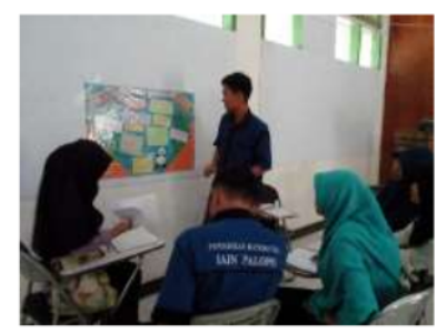
Figure 2 Group Presentation/Work Visit