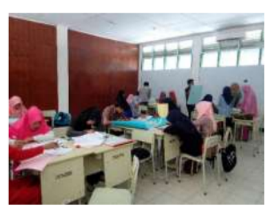
Figure 1 Work in group

Figure 1 above shows students carrying out group work activities to prepare presentation materials and discuss the material their groups have obtained.